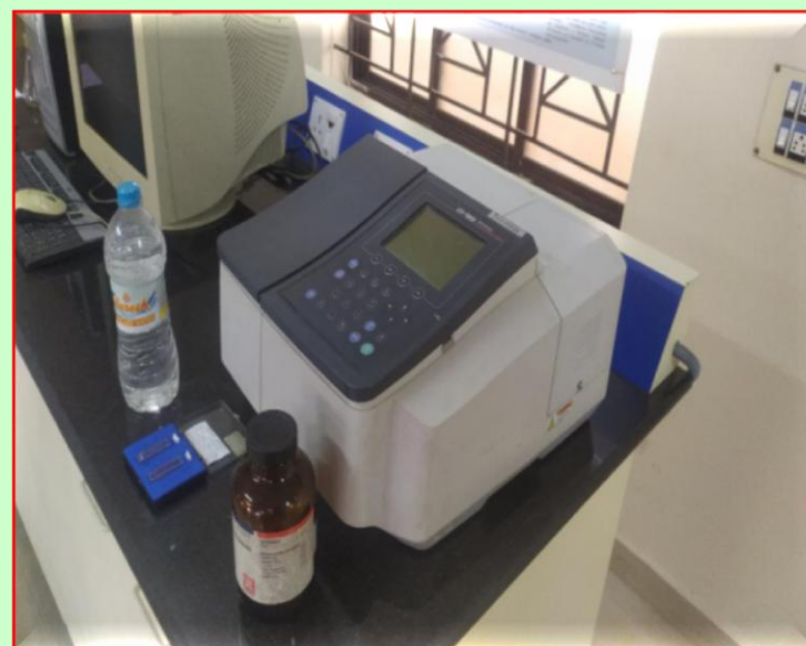
UV – Visible Spectrophotometer