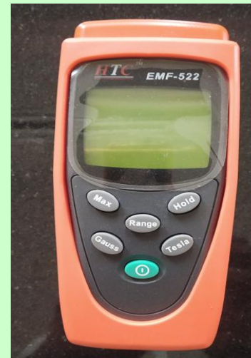
Electromagnetic Field Tester