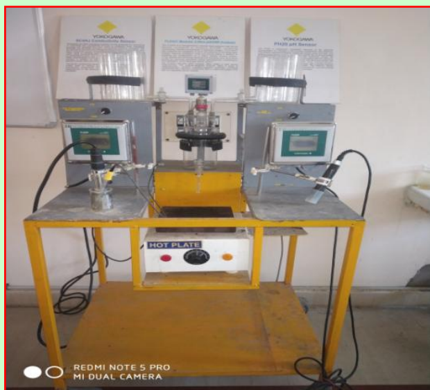
Conductivity and pH Analyser