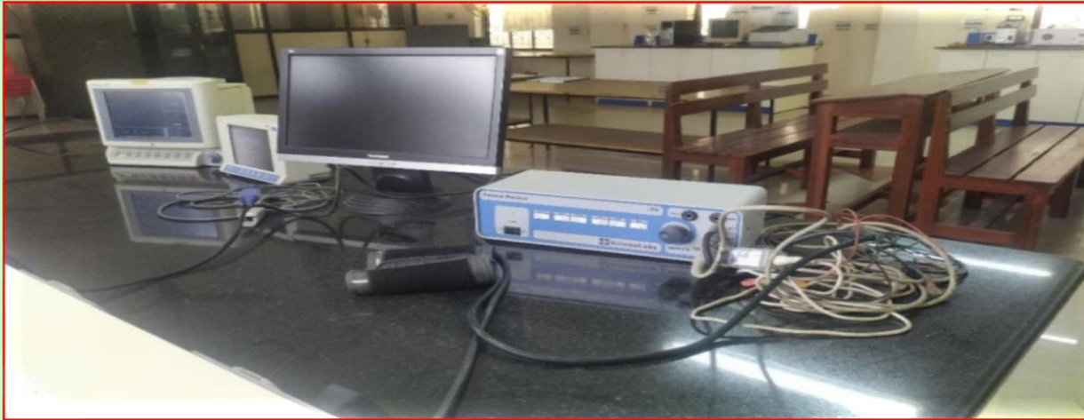
Vital Sign Monitor