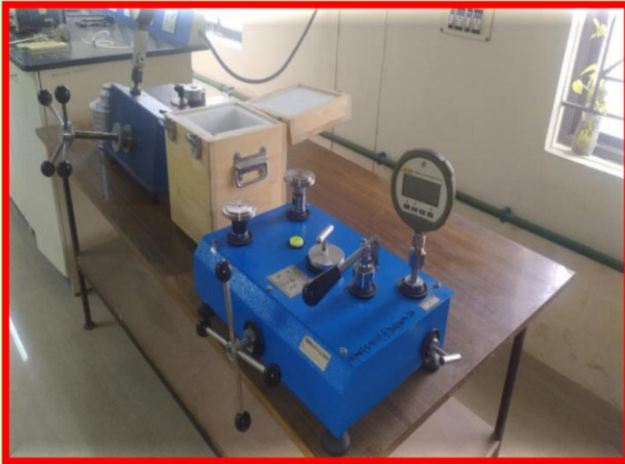
Dead Weight Tester