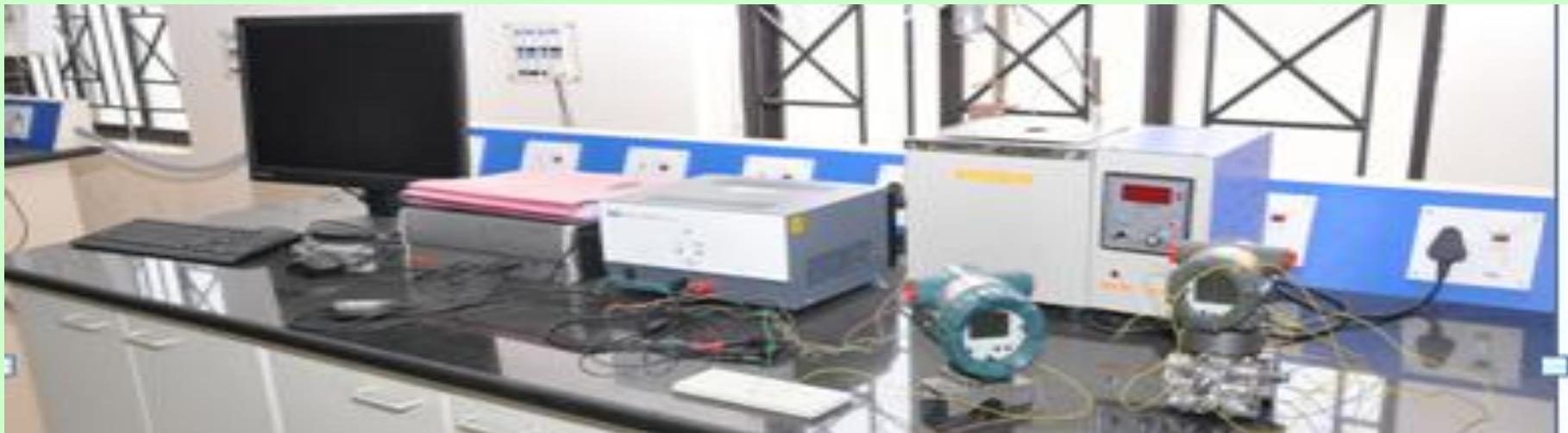
HART Communicator with Pressure Transmitter and Temperature Transmitter