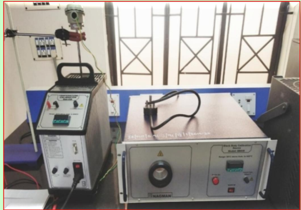
Black Body Calibrator and Temperature Calibrator