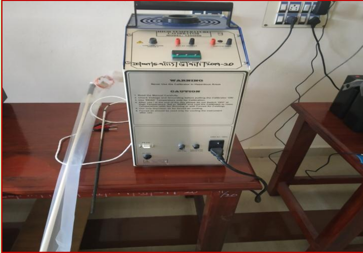
High Temperature Calibrator