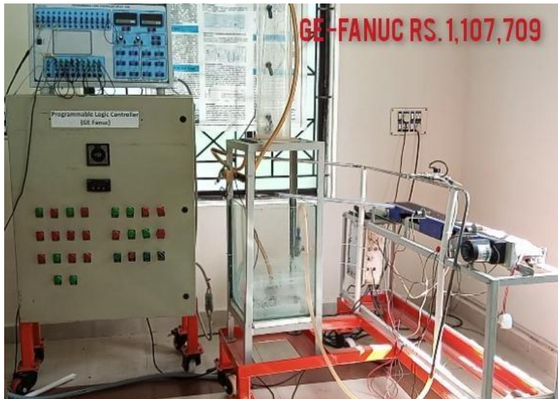
GE-FANUC RS. 1,107,709