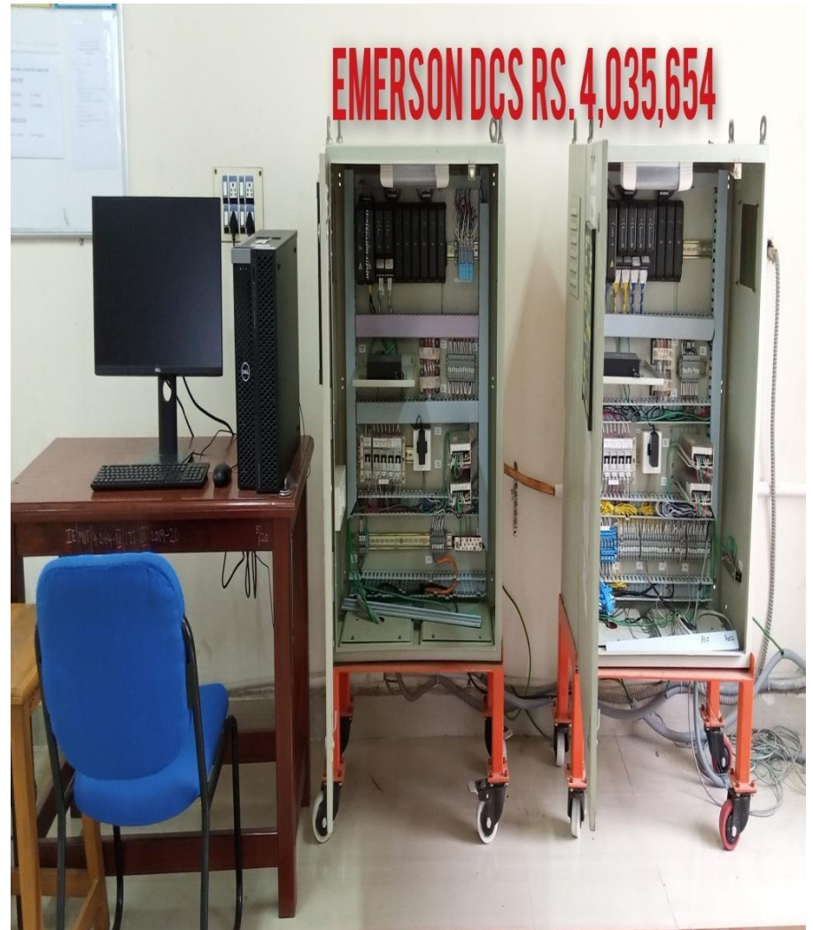
EMERSON DCS RS. 4,035,654