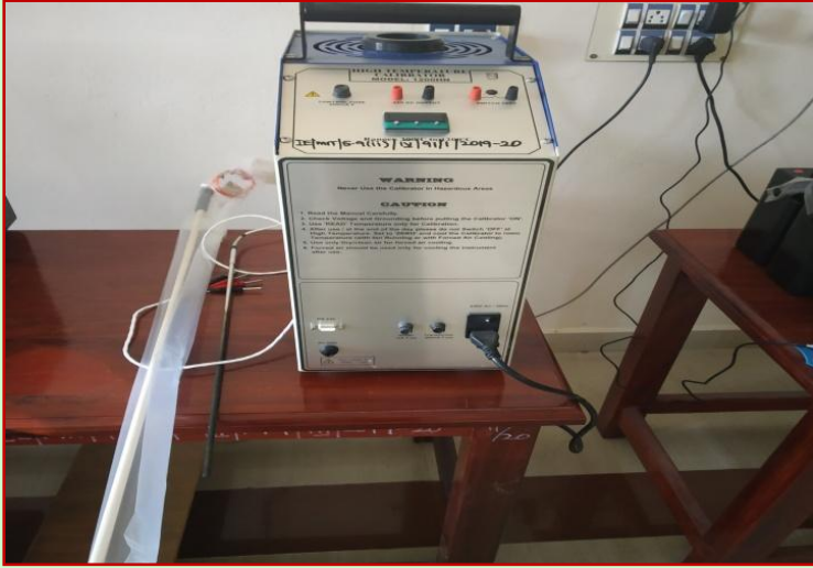
High Temperature Calibrator