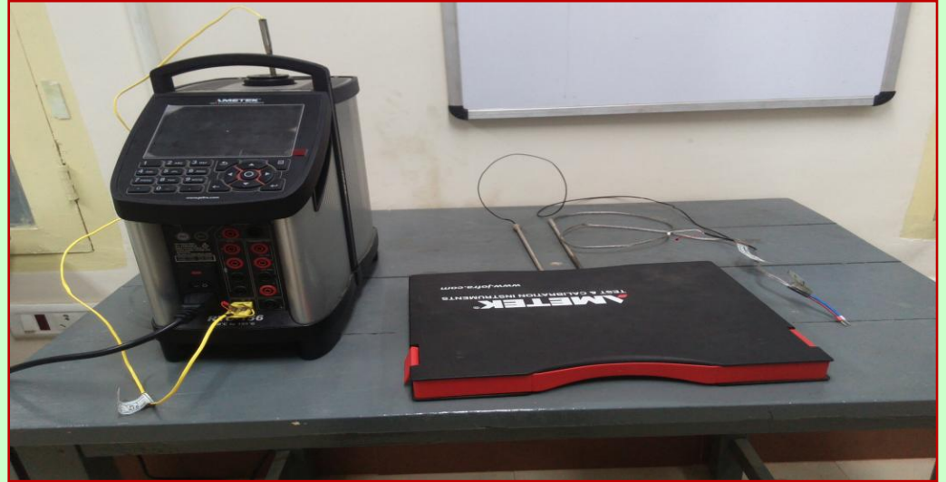
Low Temperature Calibrator