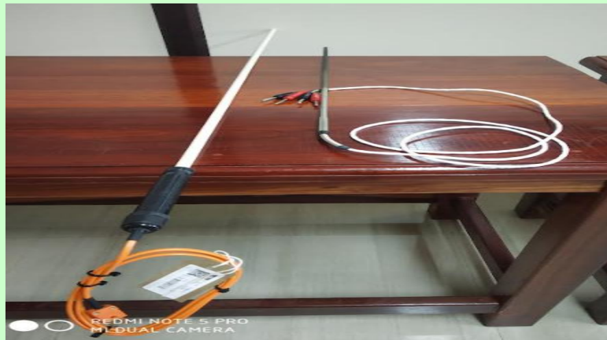
Reference standard R type Thermocouple Reference sensor (RTD) probe