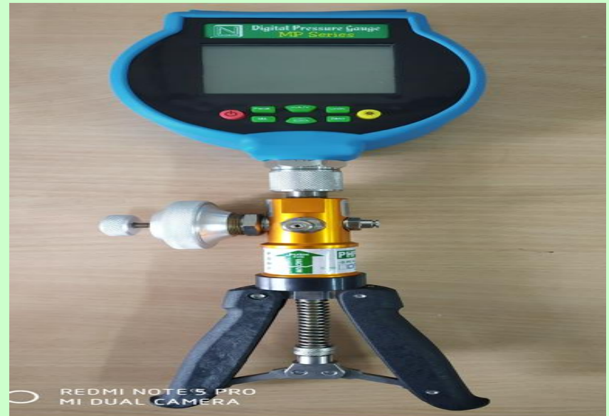
Smart Pressure Calibrator