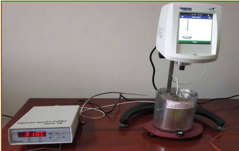
Viscometer and Thermosel