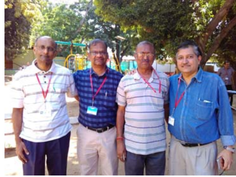
Above :31st batchmates